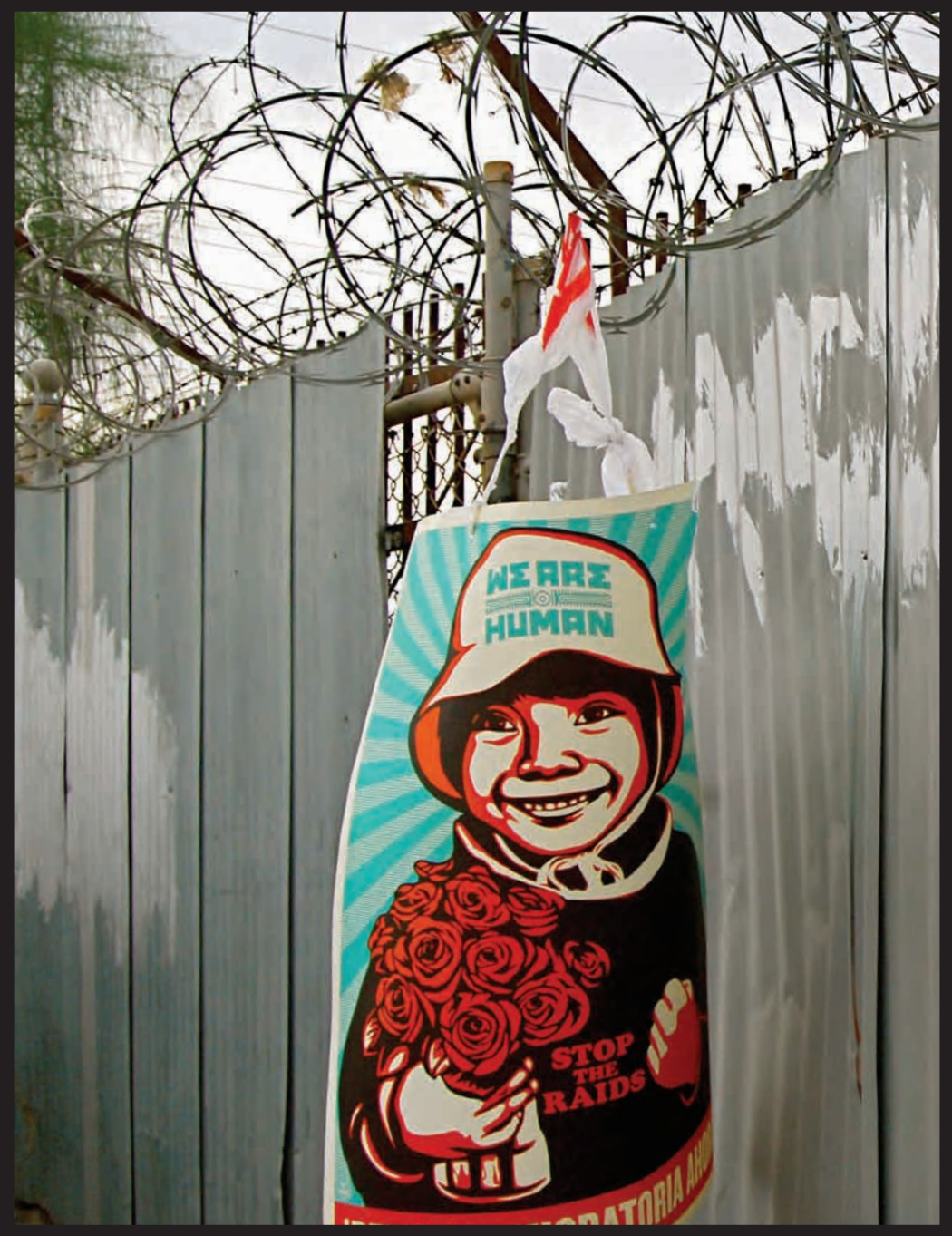
Enduring abuse in Arizona immigration detention centers